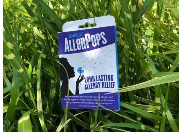
Allerpops product image.

The New Mexico Economic Development Department's mission is to improve the lives of New Mexico families by increasing economic opportunities and providing a place for businesses to thrive.