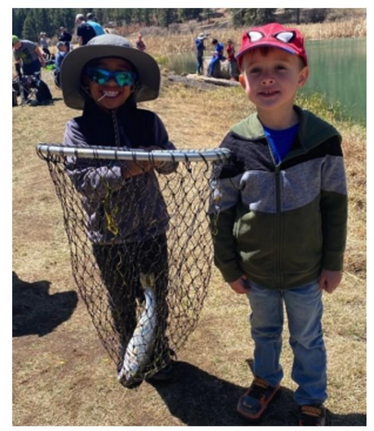
Taking your kids fishing is a fun family activity, whether you're an experienced angler or taking up the sport for the first time.