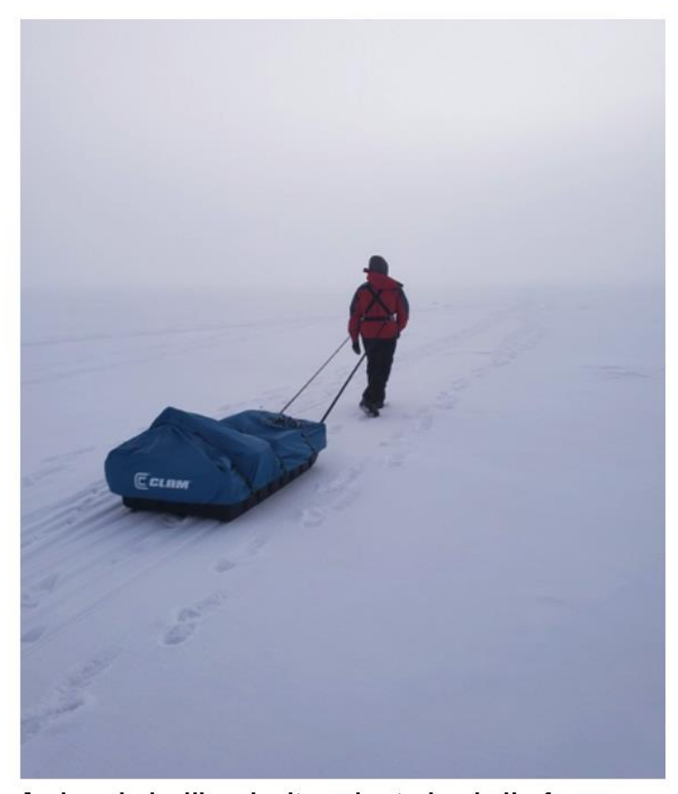
An ice sled will make it easier to haul all of your gear across the ice.

The last thing I want to share with you all is bait. I have been successful using tungsten, glow-ice jigs for catching many species of