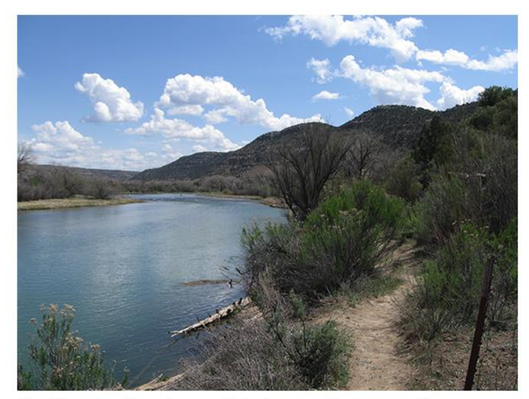
Fishing for trout was fair to good when using midge-pattern flies and peach egg-pattern flies in the quality waters on the San Juan River last week.

Cochiti Lake: We had no reports from anglers this week.