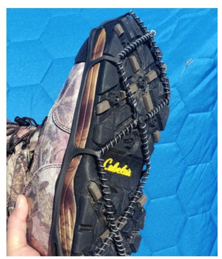
Yaktrax attached to your boots help to improve traction while walking on ice.

Ice fishing only requires a few things to get started: an auger, a fishing pole and some bait. But there are so many other items that can help you enjoy this sport even