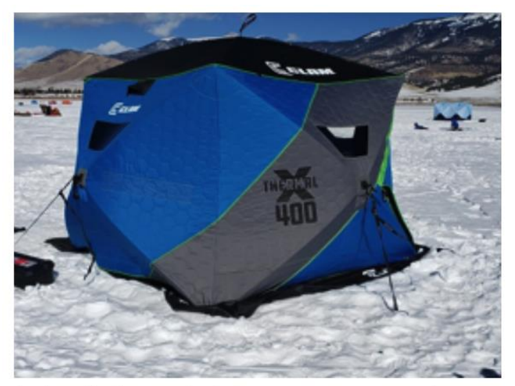
An ice shelter can help keep you warm even in extremely cold conditions.

The next item I want to share with you is the one item that has made me catch tons of fish: an ice-fishing flasher. This tool has helped me tremendously over the years get on more fish. An ice-fishing flasher is a machine that will track your depth and any fish below it. Like augers, there are many to choose from like Marcum, Hummingbird and Garmin; however, I prefer Vexilars. I have had many people tell me that using fishing electronics is cheating, but when I let them use one of mine, it is amazing how quickly their mindset changes. I've seen people dropping their lines all the way to the bottom of the lake when the fish were cruising halfway down, and they never knew the fish were there because they were not tracking the fish with one of these