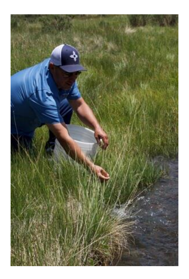
Lt. Gov. Howie Morales stocks fish.