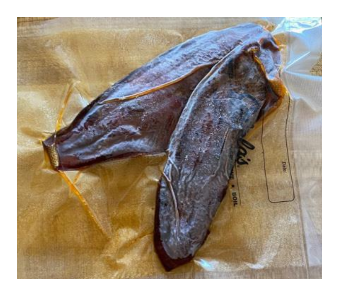
The frozen, vacuum-sealed smoked salmon portions.

Let us know how your fishing trip goes! Share your tips and tricks with your fellow anglers by emailing us at <a href="mailto:funfishingnm@gmail.com">funfishingnm@gmail.com</a> and let's help the next generation of anglers find success.