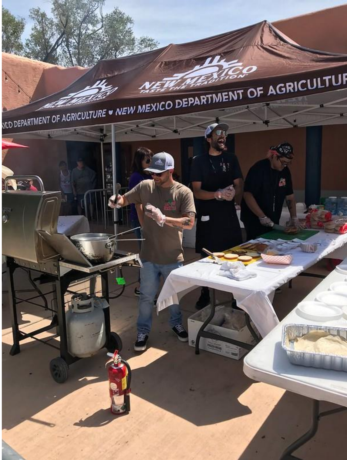
Cutline: Which green chile cheeseburger is the best? You'll have to attend the 2023 New Mexico Green Chile Cheeseburger Challenge Sept. 11 at the New Mexico State Fair to find out. Last year the teams competing had a great time grilling up their specialty for the judges.