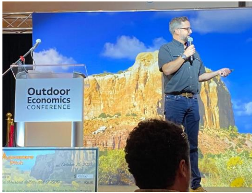
Adventure Pitch 2nd Place: GILZ