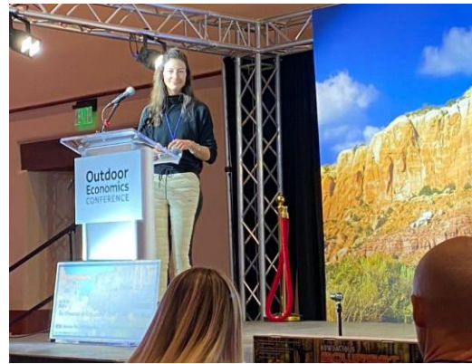
Adventure Pitch 3rd Place: Buttnski

The Outdoor Recreation Division, a division of the New Mexico Economic Development Department, aims to increase the overall mental and physical well-being of New Mexicans through the power of outdoor recreation, enabling residents throughout the state to hold jobs that afford them dignity, joy, and stability. We strive to commit to all residents to protect their state's natural heritage - its lands and waters, flora and fauna - and find a future on that path. We aim to parlay this commitment into long-term, sustainable investment, both in infrastructure and education.