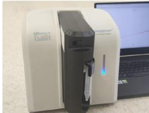
Q Biotech Product

EDD's mission is to improve the lives of New Mexico families by increasing economic opportunities and providing a place for businesses to thrive. EDD's programs contribute directly to this mission by training our workforce, providing infrastructure that supports business growth, and helping every community create a thriving economy.