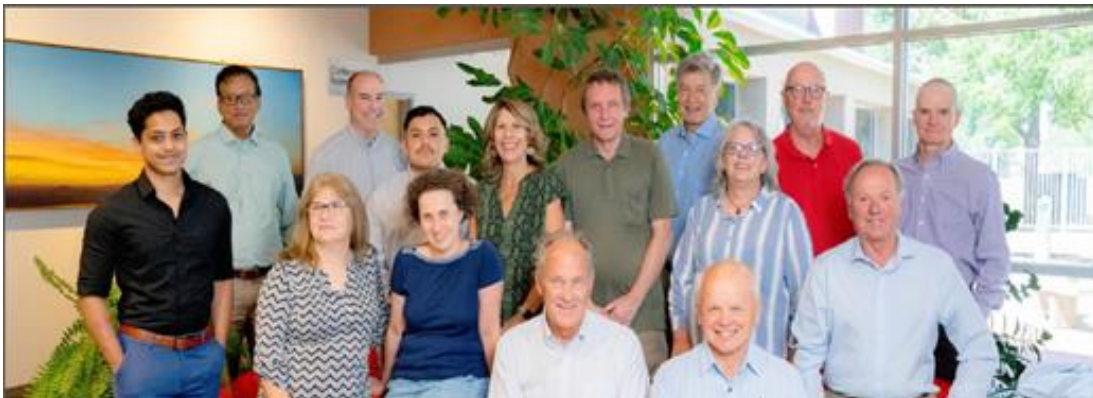
Team at Mercury Bio