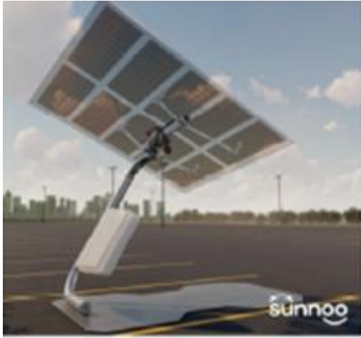
Technology at Sunnoo