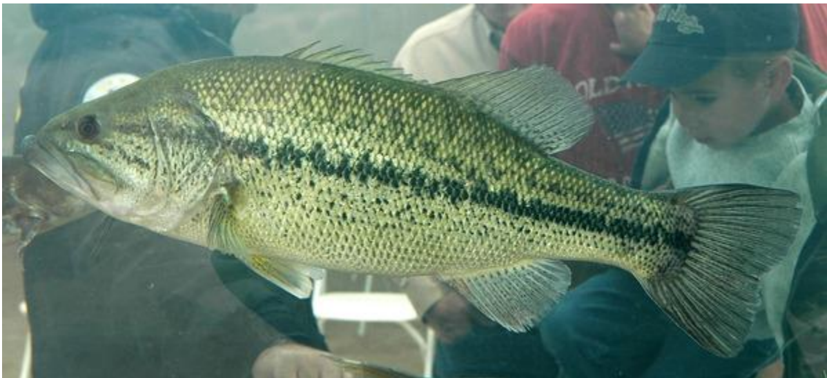
Fishing for largemouth bass was good when using worms last week at Alto Lake.