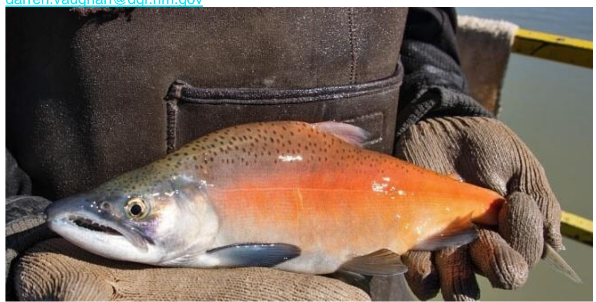
A kokanee salmon captured by Department fisheries biologists as part of annual spawning efforts.