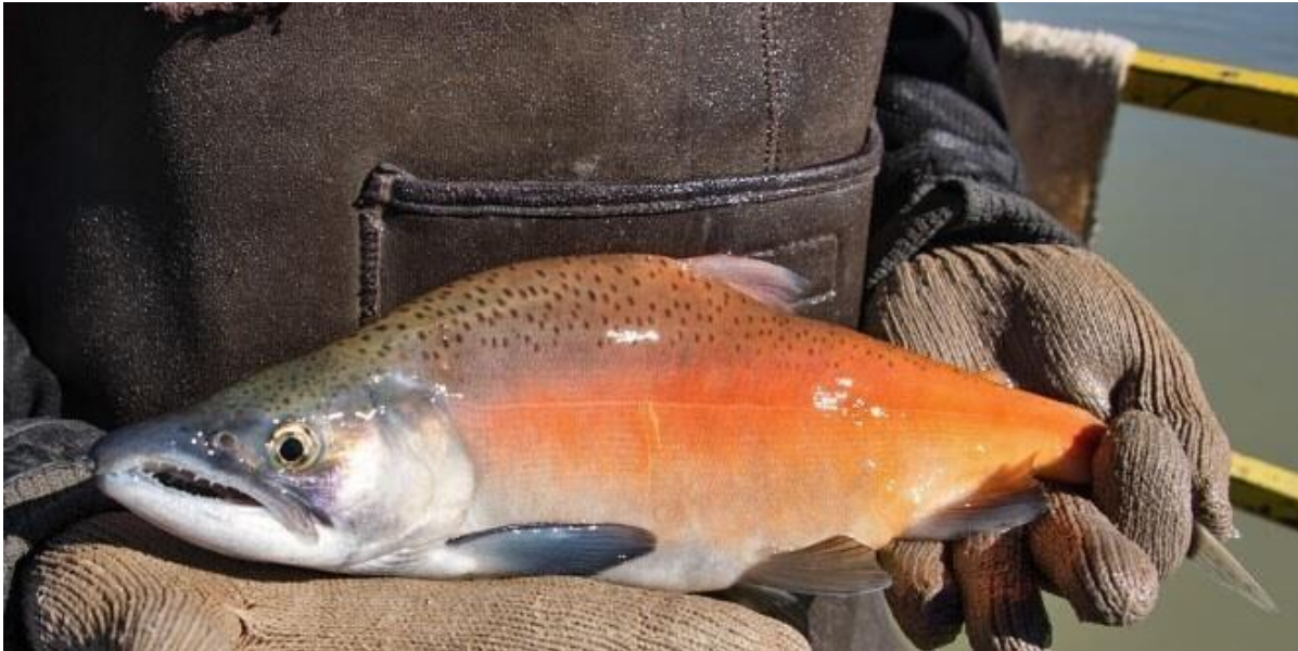
A kokanee salmon captured by Department fisheries biologists as part of annual spawning efforts.

New Mexico's annual kokanee salmon spawning efforts were derailed when its Navajo Lake holding pens were vandalized on Friday, Oct. 20. Each fall salmon are gathered into holding pens to allow Department staff to manually spawn them prior to taking the fertilized eggs to our hatchery. The holding pen was found dragged from the lake and hundreds of salmon inside waiting for spawn were missing.