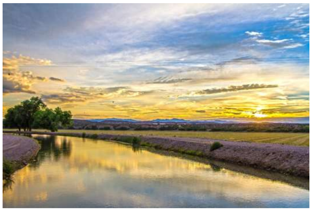
(Figure 2) Percha Dam State Park, Caballo, NM. Additional photos are available at <u>emnrd.nm.gov</u>.