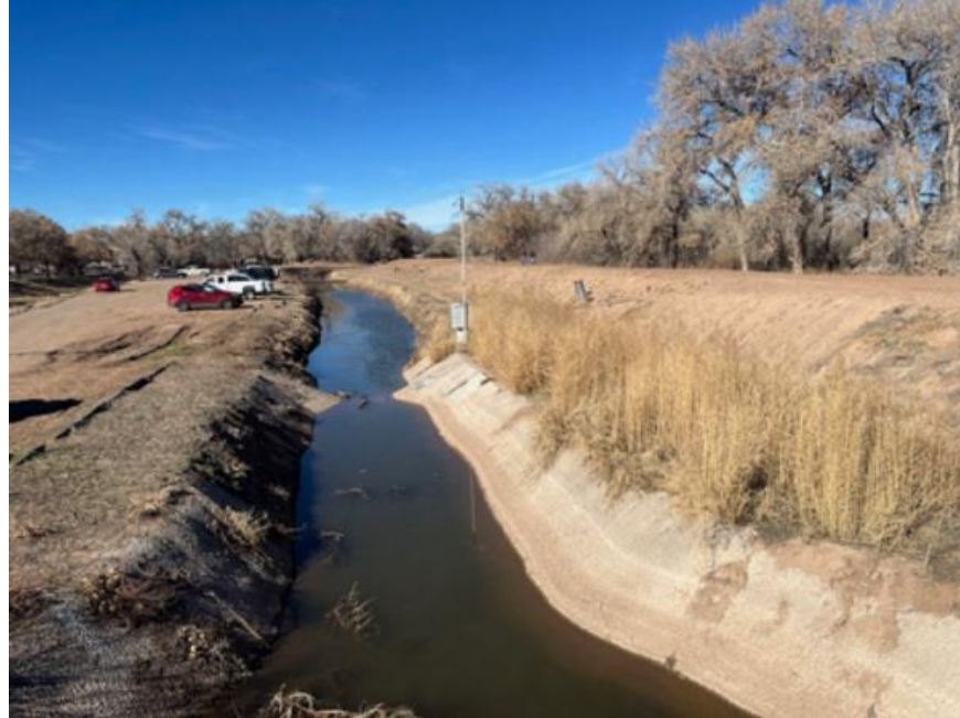
Upper Corrales Riverside Drain west of Rio Grande and North of Alameda Bridge.

One more bonus spot to try is the Bernalillo Riverside Drain, a short drive from Albuquerque. There have been a few people reporting having success there lately and it is worth a shot. On Saturday when I stopped by, there were several people fishing.