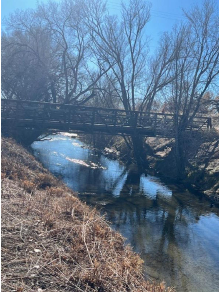
Albuquerque Riverside Drain east of Rio Grande and south of Alameda Bridge.