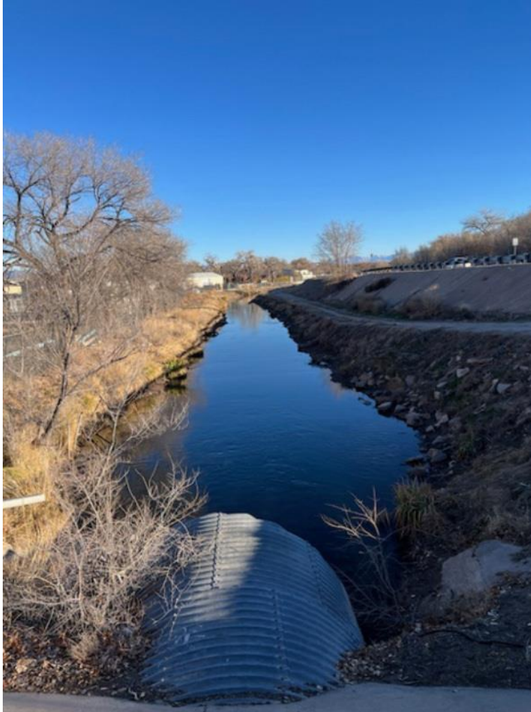
Albuquerque Riverside Drain east of Tingley Beach.

On the east side of where Rio Grande Boulevard goes over Paseo del Norte, there is a parking lot and trail that leads west towards the Rio Grande. Before you get to the river, you will reach the Albuquerque Riverside Drain east of the river and south of the Paseo del Norte Bridge. There is a theme—where there is a bridge crossing the river, there is a deep fishing hole in the drain. This stands true at what I call the “Paseo del Norte Bridge Spot.” There were several anglers fishing there on Saturday and they were catching a few trout using worms and salmon eggs.