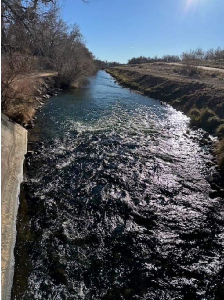
Albuquerque Drain east of Rio Grande and south of Montano Bridge.

I know there are some fishing spots south of Tingley Beach, but I am not familiar with them because as far south as I went was to fish the Albuquerque Riverside Drain on the east side of Tingley Drive. Sometimes I'd be fishing Tingley Beach with little success and find the drain to the east (across Tingley Drive) to be uncrowded and home to a bounty of trout. On Saturday, I saw one angler catch a fish in the drain but was unable to ask him what he caught it with.