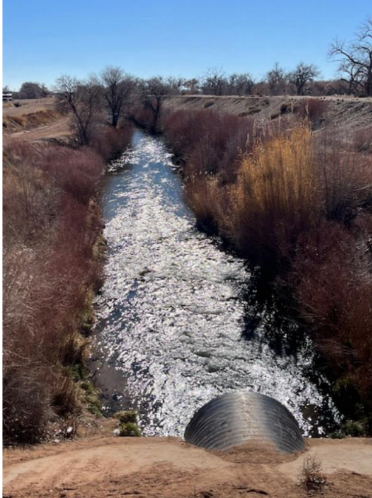
Bernalillo Riverside Drain east of Rio Grande and south of U.S. Highway 550 Bridge in Bernalillo.

The Department would like to remind anglers to always keep safety in mind when fishing, especially in area ditches and drains. Avoid areas with steep embankments and fast-moving water, and always fish with a partner.