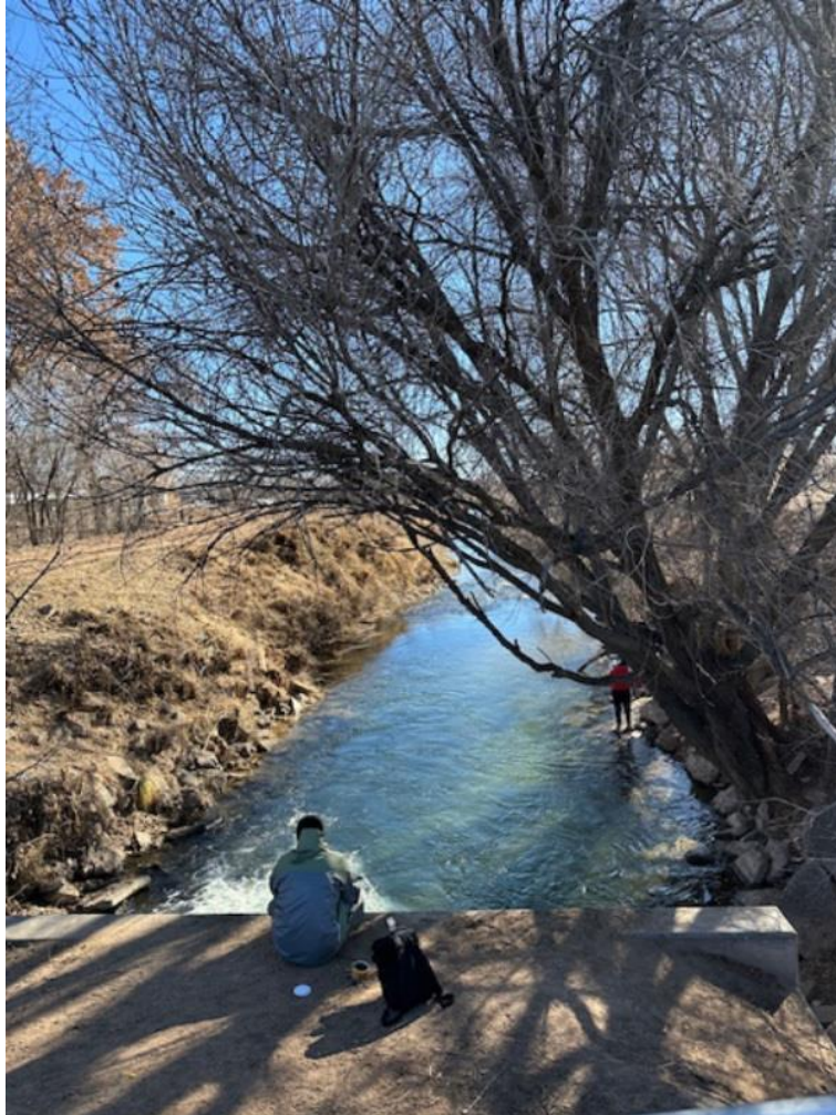
Albuquerque Riverside Drain east of Rio Grande and south of Paseo del Norte Bridge.

At the Alameda Bridge, there are fishing spots on both sides of the river. On the east side of the river south of Alameda Bridge, there is a nice deep hole in the Albuquerque Riverside Drain that usually holds trout. I met an angler here last year who was catching fish using a red San Juan Worm fly. On the west side of the river north of Alameda Bridge, there is a parking area that allows you to access the Upper Corrales Riverside Drain. I used to keep a spinning rod in my truck and a couple of Panther Martin spinners because I could stop at this spot on my way home from work. If I saw fish there, most of the time I could catch a couple using a black Panther Martin spinner with a gold blade.