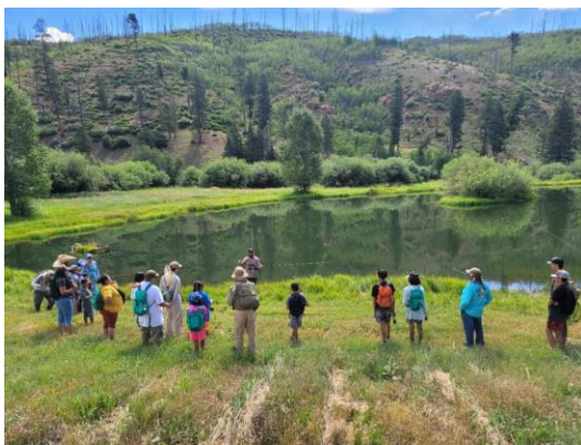
Women's Fishing and Indigenous Youth Fishing Events.

The mission of the Outdoor Recreation Division, a division of the New Mexico Economic Development Department, is to increase equitable access to the outdoors for all New Mexicans, ensuring healthy outcomes, environmental stewardship, and economic prosperity.