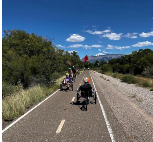
Day of the Tread Bike Race.