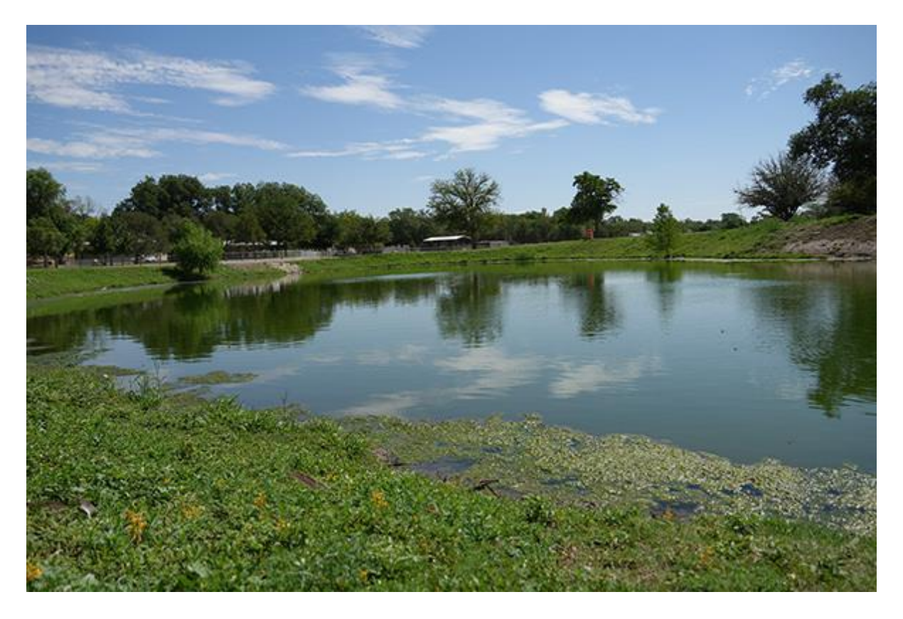
Fire activity and hot temperatures made for light fishing pressure in southeastern New Mexico last week.